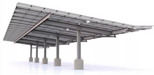
South Lot - 10 Pond St. (behind Worthy Girl) T-style canopy