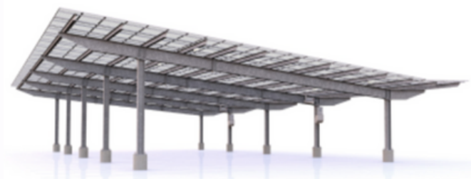
North Lot - 11 Pond St. (behind the Cabot Lodge) Long-span style canopy